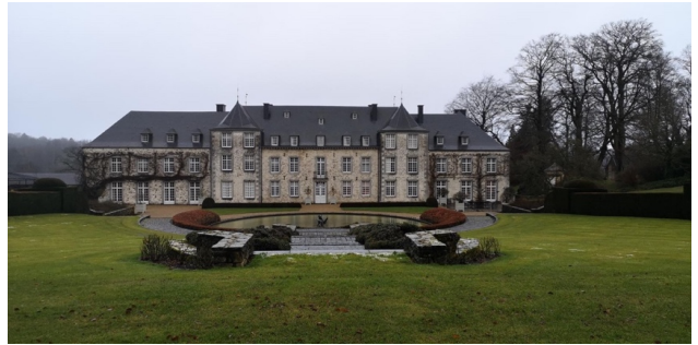
Ill. 13. Ramezée castle, Belgium.