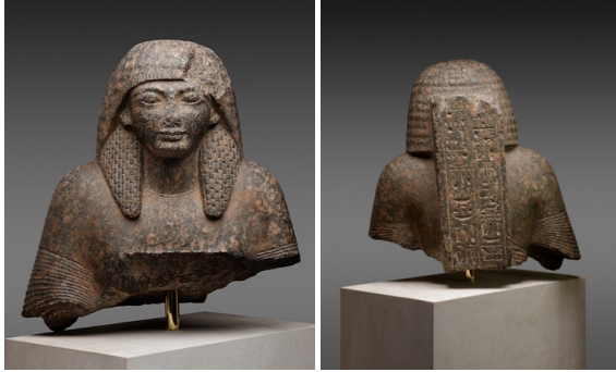
Ill. 11. Bust of a naophorous statue, Egypt, New Kingdom, Dynasty XIX, ca. 1301-1200 BC, granite, H. : 43 cm. The Metropolitan Museum of Art, New York, inv. no. O.C.3525.