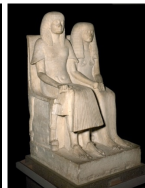
Ill. 7. Naophorous statue, Egypt, New Kingdom, Dynasty XIX, reign of Ramses II, limestone, H. : 64 cm. Musée du Louvre, Paris, inv. no. N 71.