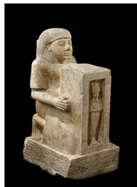
Ill. 6. Naophorous statue, Egypt, New Kingdom, late Dynasty XVIII, ca. 1300-1295 BC, Egyptian quartzite, H. : 61 cm. Musée du Louvre, Paris, inv. no. N 61.