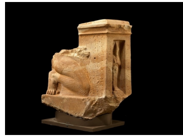
Ill. 5. Naophorous statue, Egypt, New Kingdom, Dynasty XIX, ca. 1295-1186 BC, Egyptian quartzite, H. : 42,7 cm. Musée du Louvre, Paris, inv. E 25457.