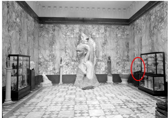
Ill. 14. Our bust in the musée de Mariemont.