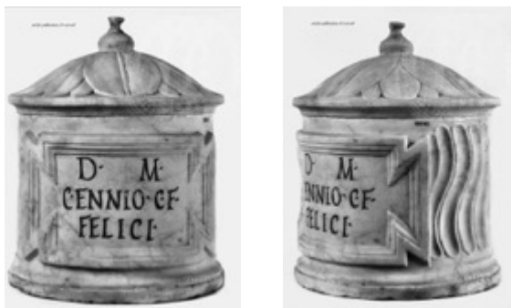
Il. 2: Strigillated Urn, found in Roma, via Appia, marble, Vatican, Museo Gregoriano Profano, inv. N° 10590.