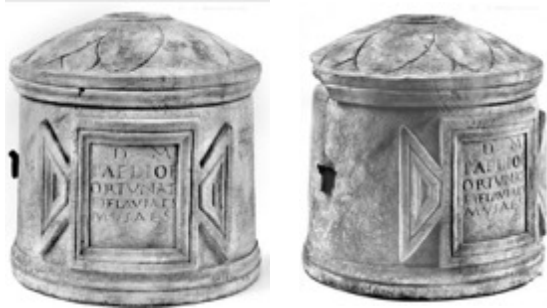
Il. 1: Strigillated Urn, found in Ostia, marble, Vatican, Museo Gregoriano Profano, inv. N° 10697.