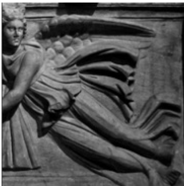
Ill. 1. Sarcophagus with a Medallion, Archaeological Museum of Antalya, Turkey.