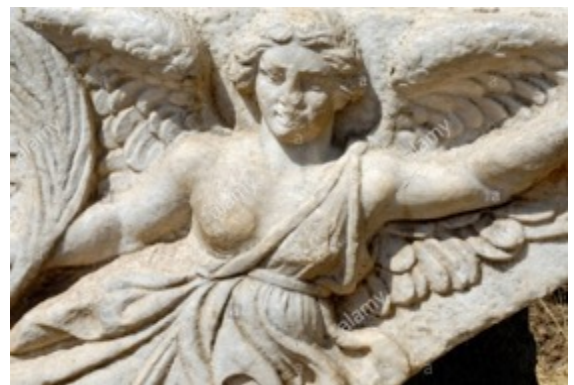
Ill. 2. : Relief depicting a Victory, archaeological site of Ephesa, Turkey.